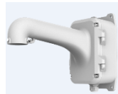
HIA-B471-B Wall mount with junction box