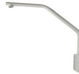
HIA-B473 Parapet wall mount